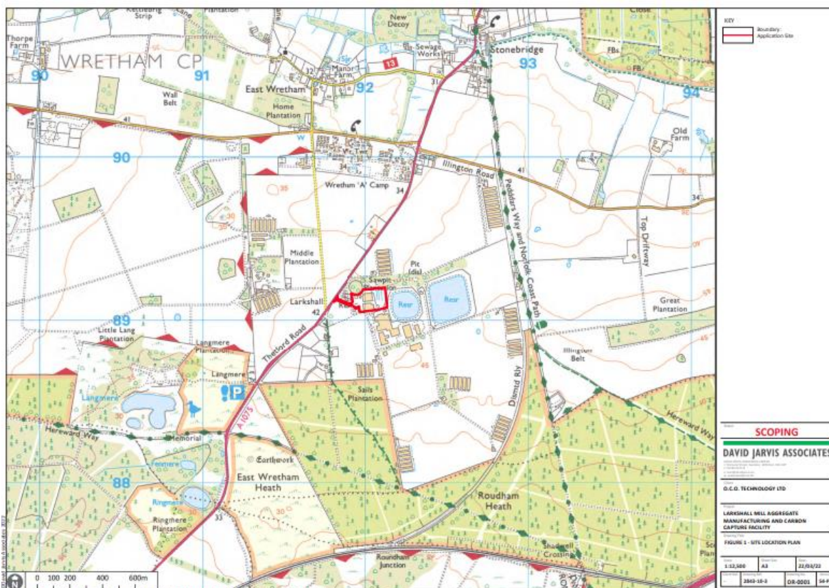
Figure 1: Site location plan