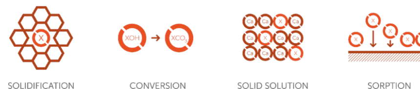
Figure 4: Solidification/Stabilisation Processes

Finally, the combined mixture undergoes pelletising to form the rounded product. Further \text{CO}_2 naturally combines with the product whilst it undergoes curing and storage on site. The technology is adaptable to a wide variety of thermal residues including those arising from biomass, energy from waste, cement manufacture, steel and aluminium production, paper manufacture, and wastewater treatment. The reaction promotes rapid solidification and improves mechanical properties and modification of contaminant mobility (see figure 4). Carbonation results in a reduction in porosity due to the formation of voluminous calcium carbonate in the pore space. This aids the retention of contaminants through improved physical containment. Crystals of calcium carbonate join in an interlocking lattice, forming an unimpaired bond between grains.