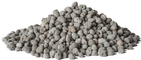
Figure 2. Typical M-LS sample