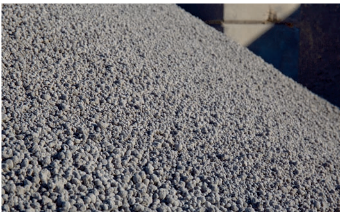
Carbon negative M-LS aggregate from O.C.O Technology is in demand as a sustainable building material

Last year, O.C.O produced over 310,000 tonnes of carbon negative aggregate from its three UK operations in Leeds, Avonmouth and Suffolk, a figure that continues to grow as the construction industry seeks to improve its sustainability credentials.